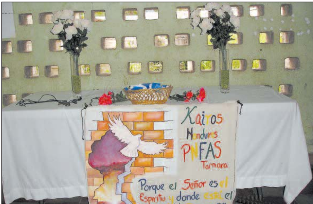
The altar that the U.S. volunteers created for the Kairos Weekend. The banner was designed and painted by the Spiritual Director for the Weekend.

After four years of preparation for this moment, it was worth the wait. God blessed us immensely to bring this Kairos to 21 women inside whose lives were touched individually with God's love. One woman told me that this experience taught her to care for her cellmates and to love them no matter what religion they belong to. Another woman expressed to me that this Kairos has moved her soul to thirst for the Spirit of The Lord. There were