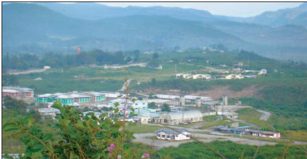
Tamara Prison (Penitenciaría Nacional Femenina de Adaptación Social - PNFAS) complex with men's unit, women's unit and youth unit.

still coming. I'm humbled and thankful for all those I served with. It was a true blessing. Many thanks to all of you for the words of encouragement, love and prayers that all of you have given to me in this step of faith in directing the 1st Kairos for women in Honduras.